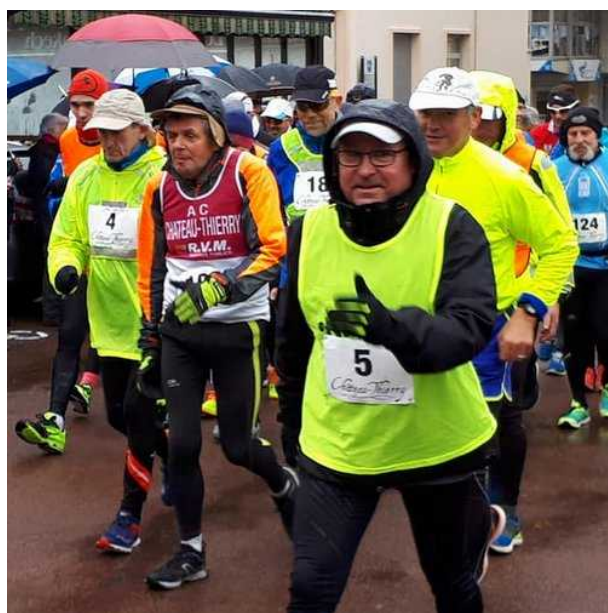
Rugged up at the start